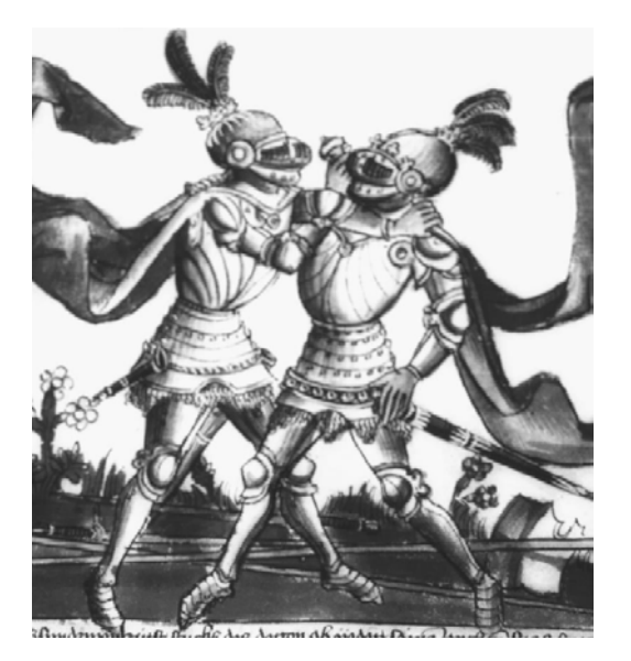
The twenty-sixth technique of the dagger: if you both have your right feet forward and thrust from above from the left side at each other's faces, and have come to each other with mutual parrying, then hang your dagger with the point down and fall with your right hand inside on his hand behind the dagger, and thrust to the right side of his neck behind his nape, and grasp with your left hand on the point of your dagger, so that you lock his neck, and stride forward with your left foot and jerk him down, as you see illustrated above.

<?Techniques 22-25 seem to be missing, although there is no gap in the manuscript> <44r>